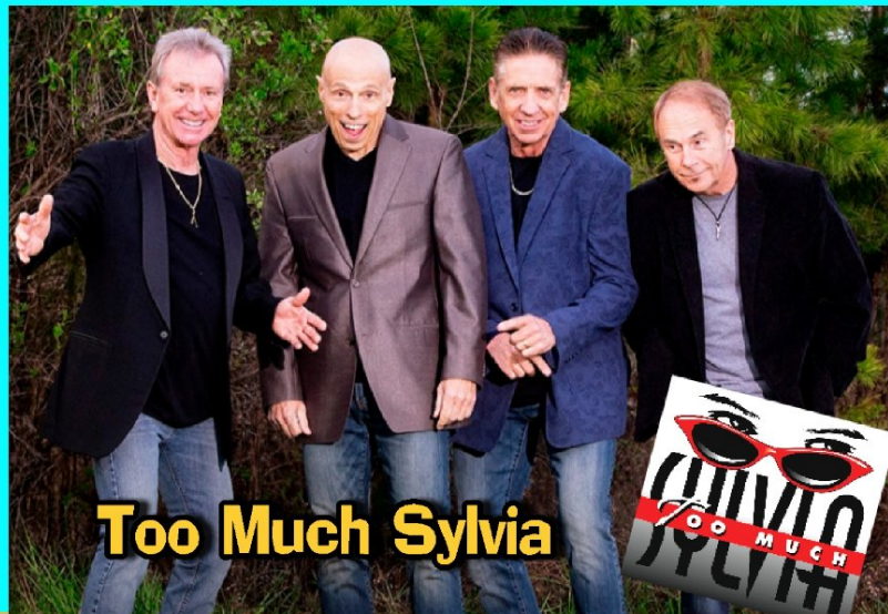
Too Much Sylvia

Come be a part of the BEST PARTY Weekend of the Year