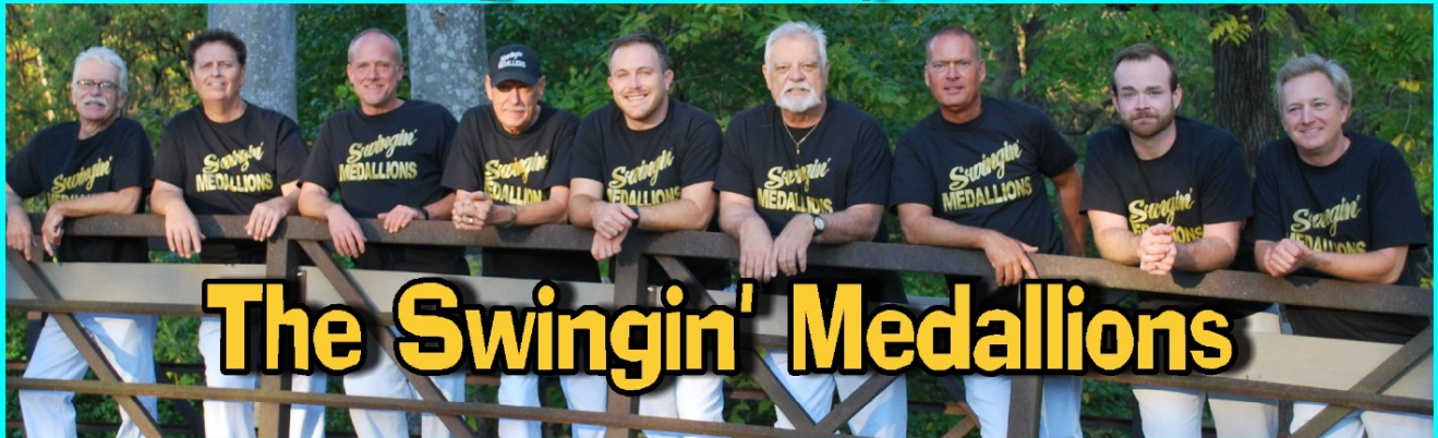
The Swingin' Medallions

12 pm TO 5:30 PM, Main Street OD September 19, 2022